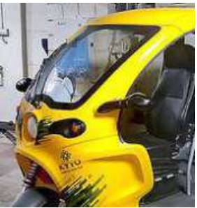
E3Ws outpaced electric two-wheelers in terms of volumes in August

The electric two-wheeler segment saw a marked dip in sales, with registrations dropping to 46,085 units in August, down from 61,498 units in July and 62,646 units in August 2023. The electric three-wheeler segment managed to outpace two-wheelers, registering 54,861 units in August, al-